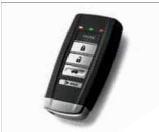
REMOTE ENGINE START SYSTEM III