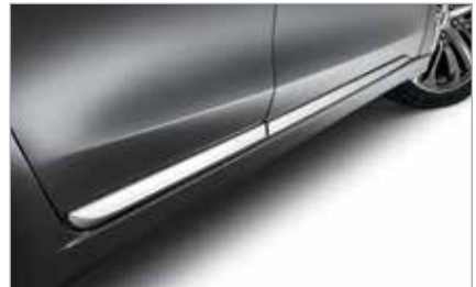
DOOR TRIM, CHROME