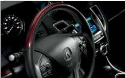
STEERING WHEEL- WOODGRAIN-LOOK