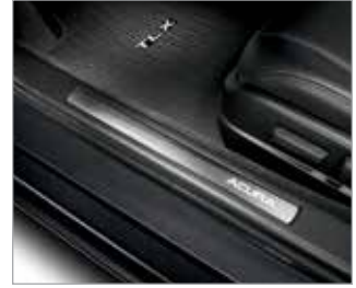
DOOR SILL TRIM-ILLUMINATED