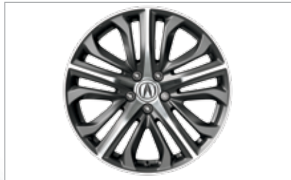
19-IN DIAMOND-CUT ALLOY WHEELS