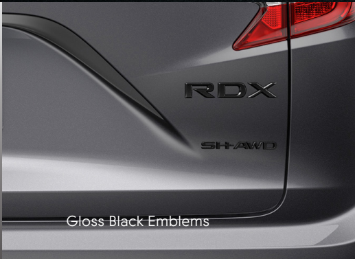
Gloss Black Emblems