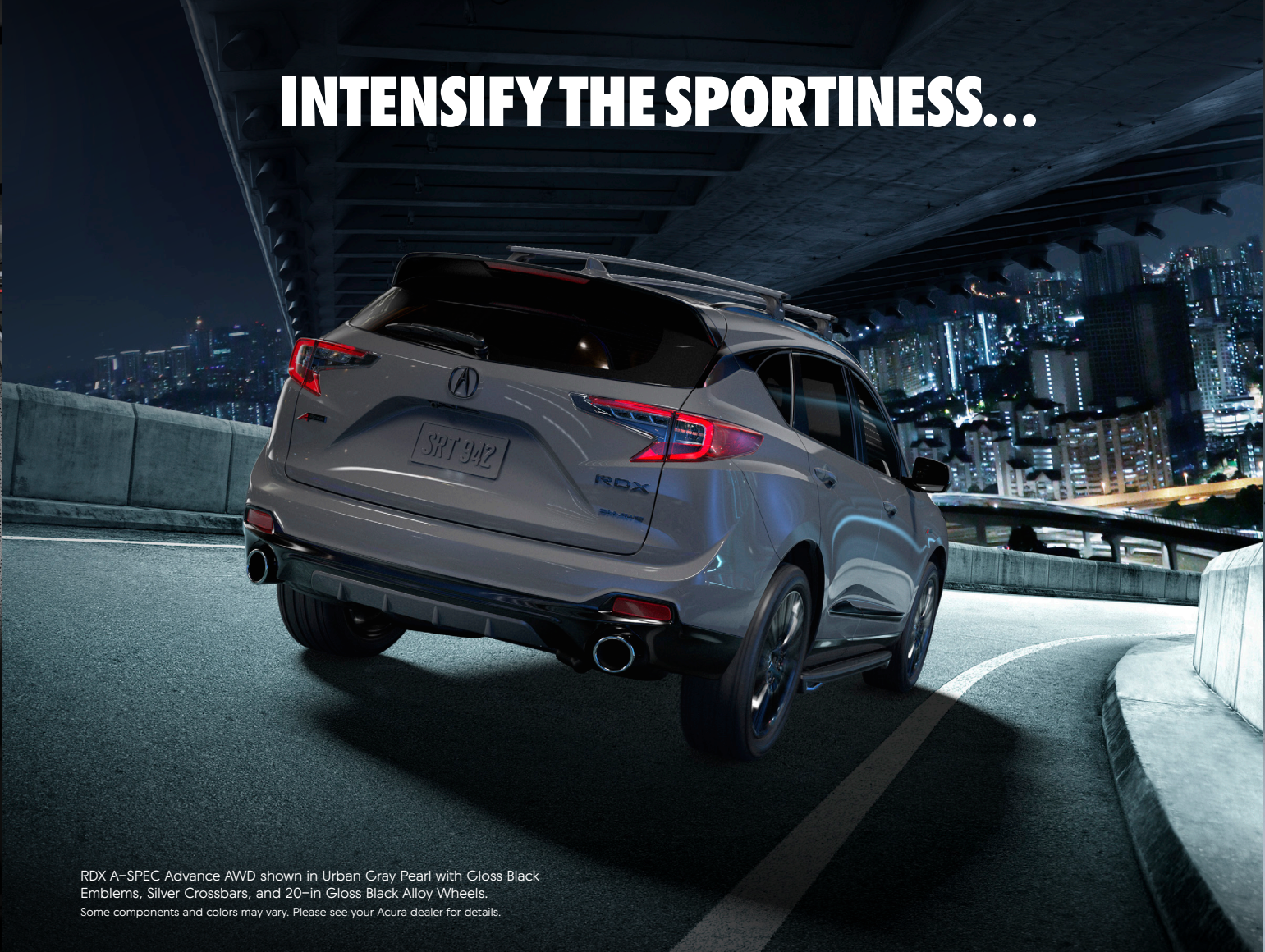
RDX A-SPEC Advance AWD shown in Urban Gray Pearl with Gloss Black Emblems, Silver Crossbars, and 20-in Gloss Black Alloy Wheels. Some components and colors may vary. Please see your Acura dealer for details.