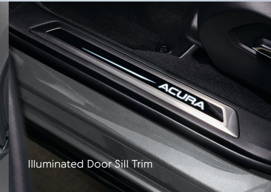
Illuminated Door Sill Trim