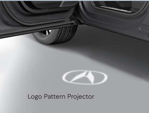
Logo Pattern Projector