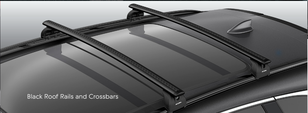
Black Roof Rails and Crossbars