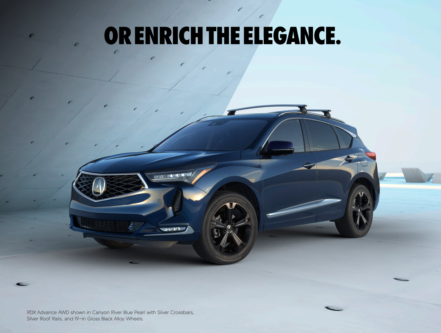
RDX Advance AWD shown in Canyon River Blue Pearl with Silver Crossbars, Silver Roof Rails, and 19-in Gloss Black Alloy Wheels.