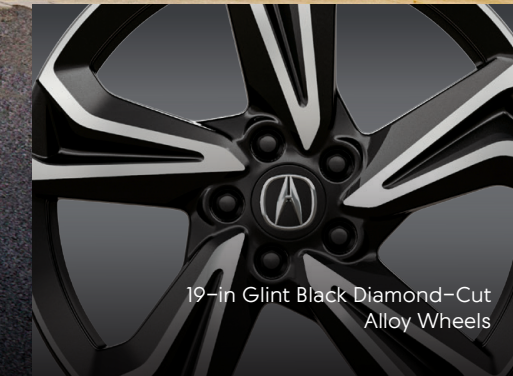
19-in Glint Black Diamond-Cut Alloy Wheels

Integra A-SPEC Tech shown in Urban Gray Pearl with Carbon Fiber Door Mirror Covers, Carbon Fiber Tailgate Spoiler, Gloss Black Emblems, Illuminated Front A-Mark Emblem, Rear Diffuser, and 19-in Matte Black Alloy Wheels with Black Wheel Locks. Some components and colors may vary. Please see your Acura dealer for details.