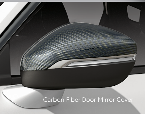
Carbon Fiber Door Mirror Cover