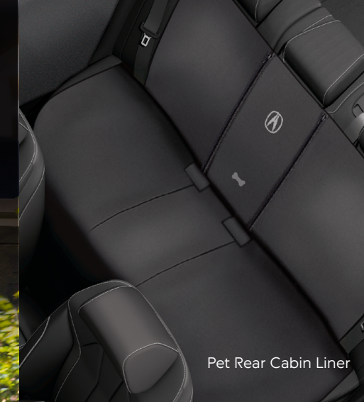
Pet Rear Cabin Liner