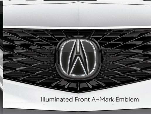
Illuminated Front A-Mark Emblem