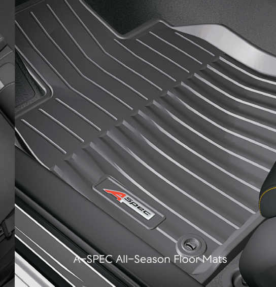
A-SPEC All-Season Floor Mats