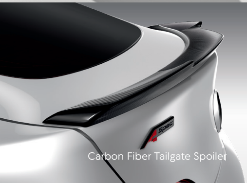
Carbon Fiber Tailgate Spoiler