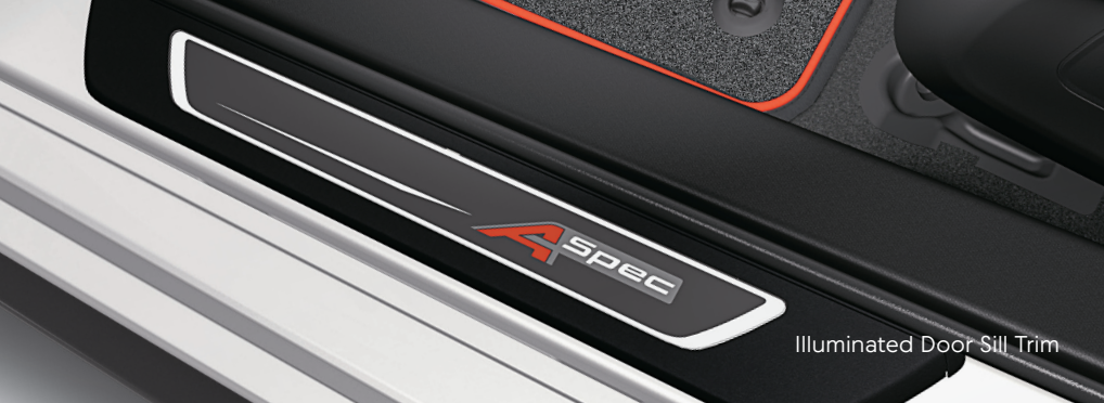
Illuminated Door Sill Trim

Make it yours with Acura Genuine Accessories