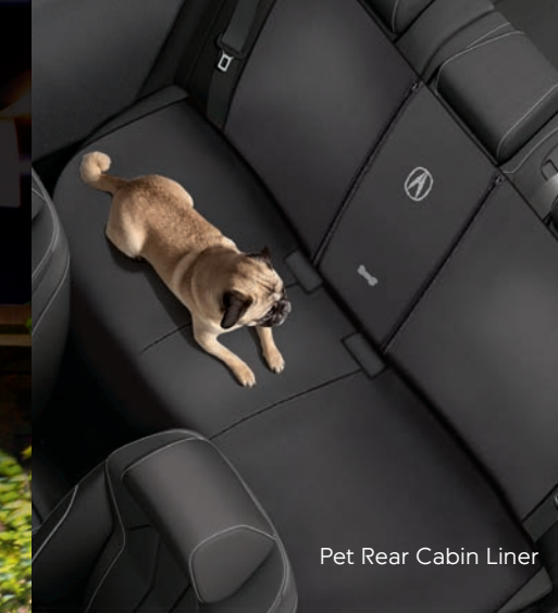
Pet Rear Cabin Liner