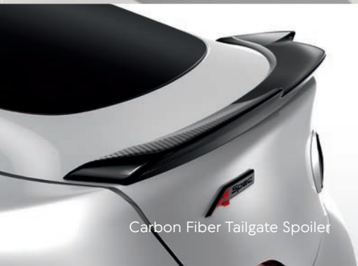
Carbon Fiber Tailgate Spoiler