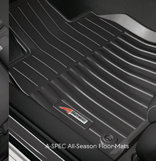
A-SPEC All-Season Floor Mats