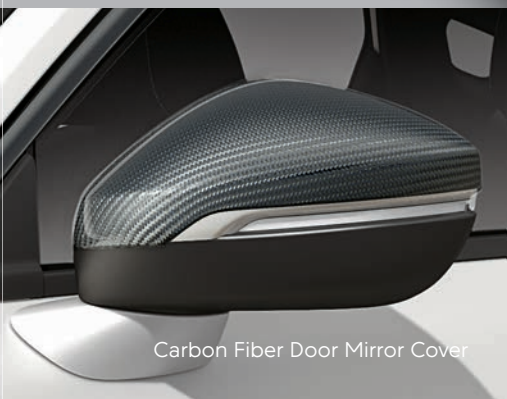
Carbon Fiber Door Mirror Cover