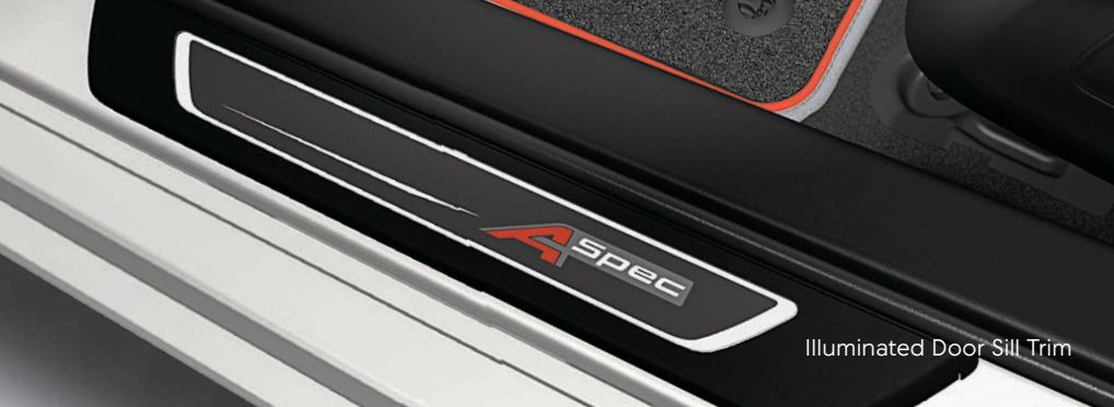
Illuminated Door Sill Trim

Make it yours with Acura Genuine Accessories